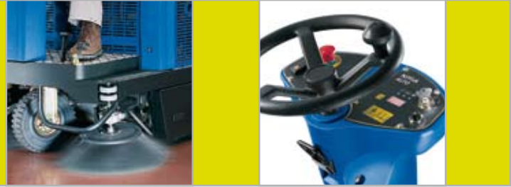
Adjustable steering wheel for excellent operator comfort

The new Nilfisk-ALTO FLOORTEC R580 is indeed a high capacity dust-free sweeper. With a working width of 1050 mm, a powerful vacuum system and a hopper size of 130 litres you can sweep large areas of floors before emptying is required.